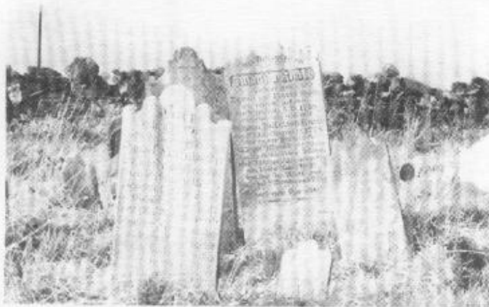
Knabb Cemetery in Oley desperately needs help!