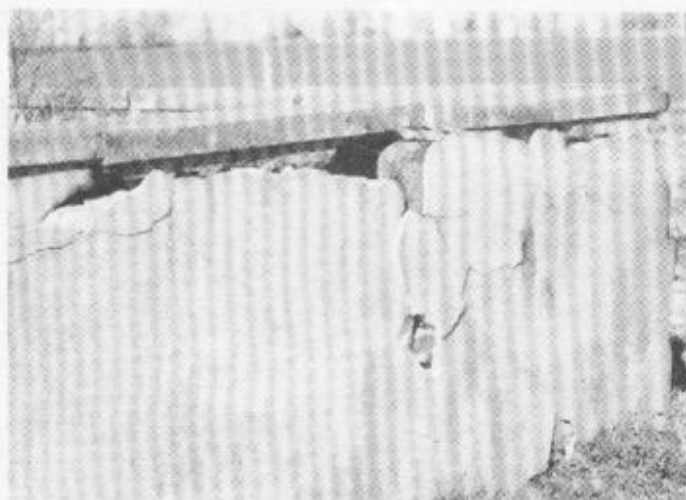
[left:] Herbein graveyard in Oley, well maintained but desperately in need of wall repair. [right:] Ely graveyard in Richmond after tombstone repairs and resetting.