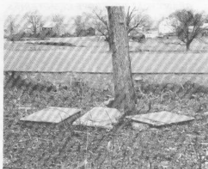
The Hunter/Kemp Graveyard in Oley. The photograph on the left shows how it appeared before the clean up. The photograph on the right shows this historic cemetery after it was cleaned up in 1994.