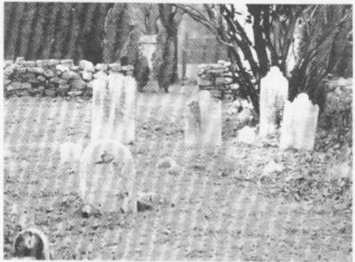
The Hoch/Bertolet cemetery in Oley—cleaned up and the wall re-stacked.