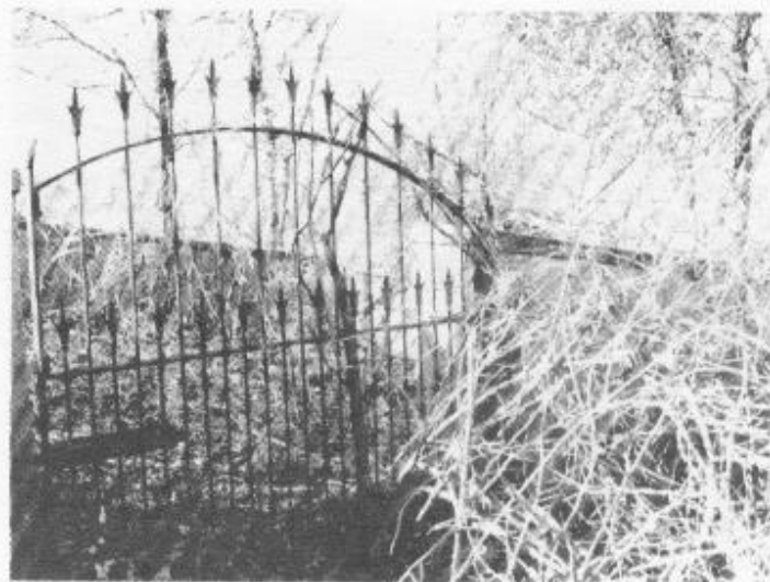
Kinsey Graveyard in Alsace which needs clean up and preservation.