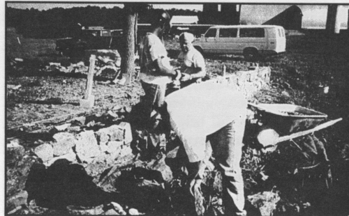
2 Hill Graveyard (First Major Masonry Project 1995)