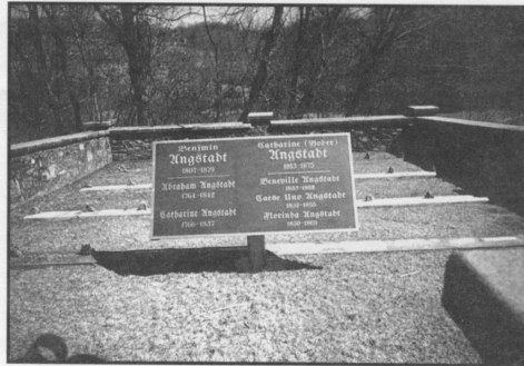
Above picture shows stainless steel plaque placed in the Angstadt Cemetery by family members.

Additional grants have been funded for the year 2002, and reports on these graveyards in Executer, Cumru and Longswamp Townships will be published later this year.