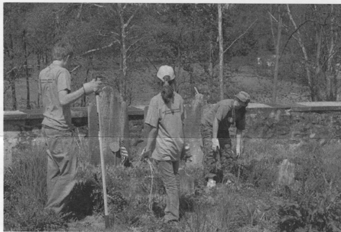
Oley Valley High School students contributing their time and outstanding work

I also would like to send a big thanks to the M & M Sandwich Shop for the outstanding hoagies...Thanks guys! They were the best!