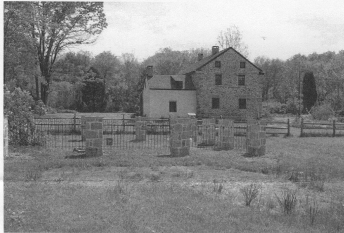
Pott Cemetery, Pike Township

The B.C.A.G.P is still obtaining approval for some changes, but a dedication ceremony is planned in the future. The stone pillars are now built, and the wrought iron gate is in the process of being re-set and re-painted. Also, a granite marker will be engraved and placed in the cemetery