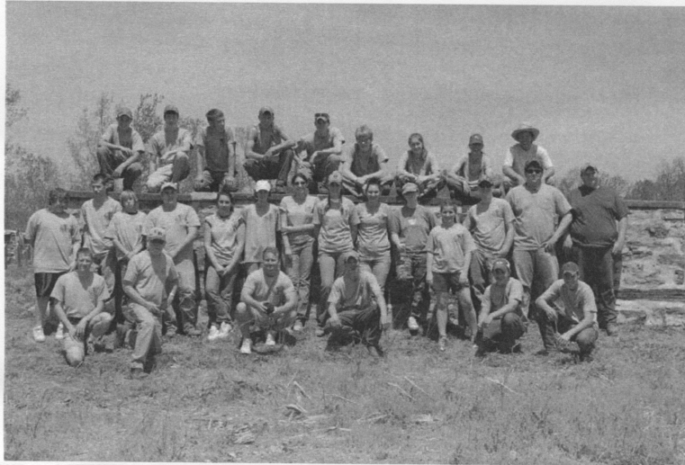
Day of Caring 2007

This was the "Day of Caring" of 2007 which like every year the fine students of Oley Valley High school spend the day using their own equipment and get together with the BCAGP members to help clean up as many as eighteen ( a new Day of Caring record) cemeteries in one day.