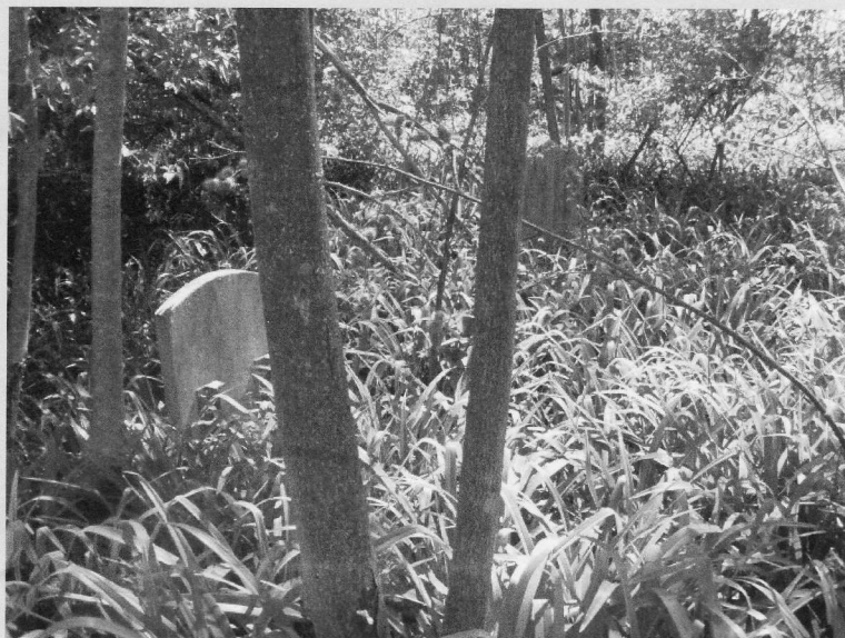
Reichard/Dumm, Rockland Township— Before