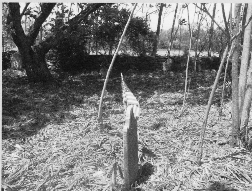
Reichard/Dumm, Rockland Township— After