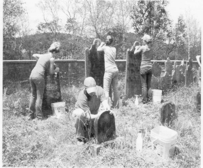
Students used a special treatment solution to clean the tombstones at the Schneider graveyard in Oley Township.