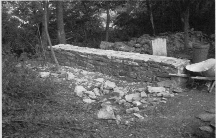
Ruppert Graveyard, Rockland Township