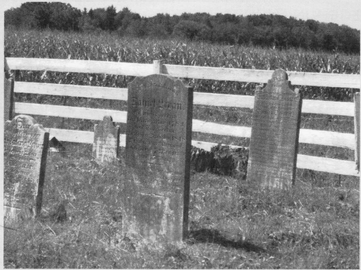
Weiser /DeTurk., Oley Township