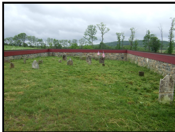
Right: 2013 Peter family burial ground