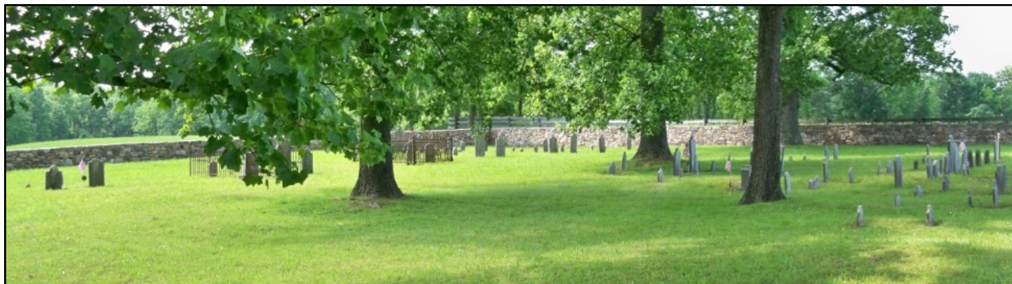
View of the Fritz Burial Ground, Douglass Township, Berks County