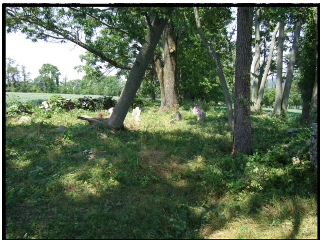
Left: 2008 Peter family burial ground