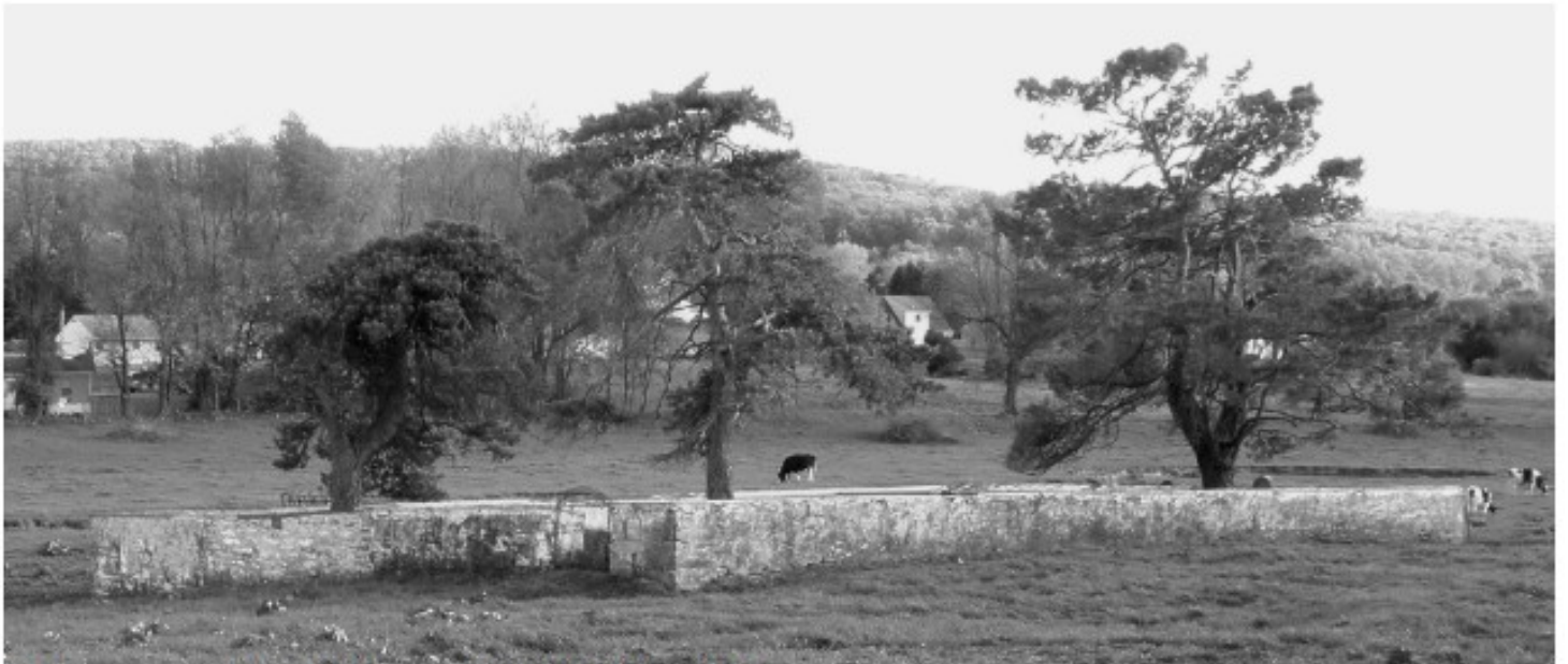
The graveyard on the former Peter Rothermel farm

We can only assume the act took place under the cover of darkness, as the graveyard is actually located close to a barn in the middle of a field visible from a well traveled roadway. The farm house is just on the other side of the barn from the graveyard. Certainly anything unusual in the daylight hours would have been noticed. No further details were found in a search of newspapers for the month following this article. If any reader knows the rest of this story, please share it with us.